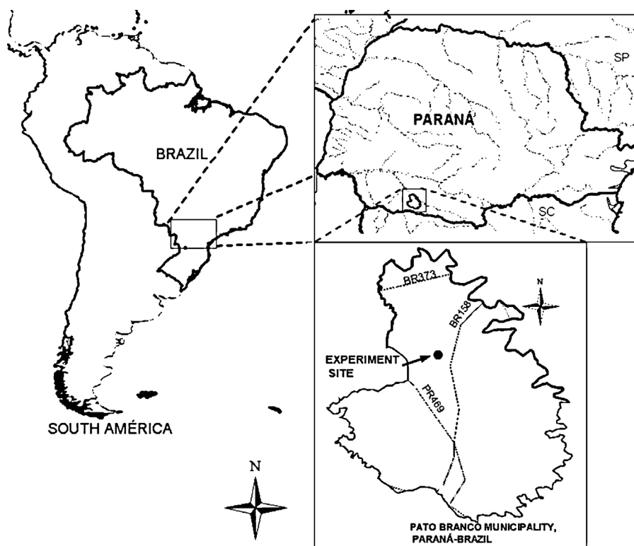
Fig. 1. Map of South America, Brazil, and Paraná State showing location of study site.

incorporated before planting the summer crop. Summer crops of maize and soybean were planted following the winter species. During the period of 1986–2005, maize was the summer crop for 8 years (1986–1988, 1992, 1994, 1996, 1999 and 2003) and soybean was the summer crop for 12 years (1989–1991, 1993, 1995, 1997, 1998, 2000–2005). The winter cover crops biomass yield, the summer crops residues and total above-ground dry biomass yield over 19 years under different winter treatments and soil management systems are shown in Table 2.